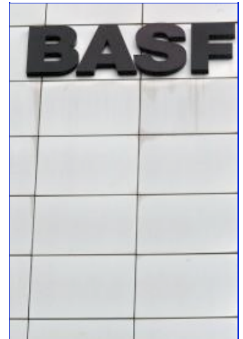
The facade of German giant BASF