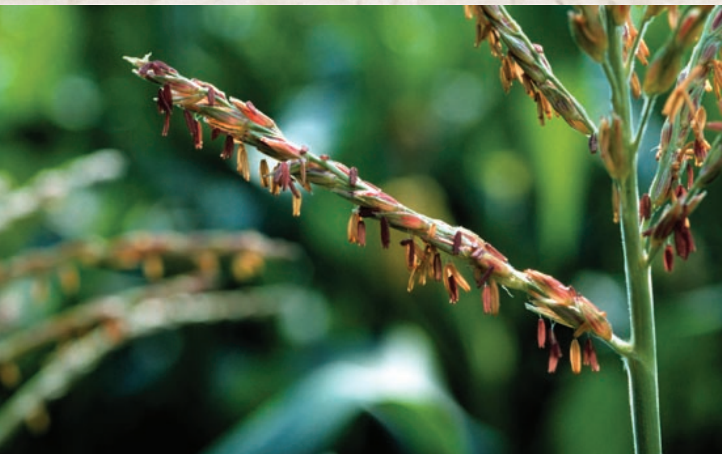
Conventional maize field. The release of GE organisms to the environment is extremely difficult to reverse. GE crops can spread by seed, pollen, animals, insects and humans.

While less than 1% of the US maize crop was planted with StarLink maize, upwards of 10% of U.S. maize was found to be contaminated. At the time, the US had a maize market valued at more than $17 billion 29 . One-third of US maize is exported to