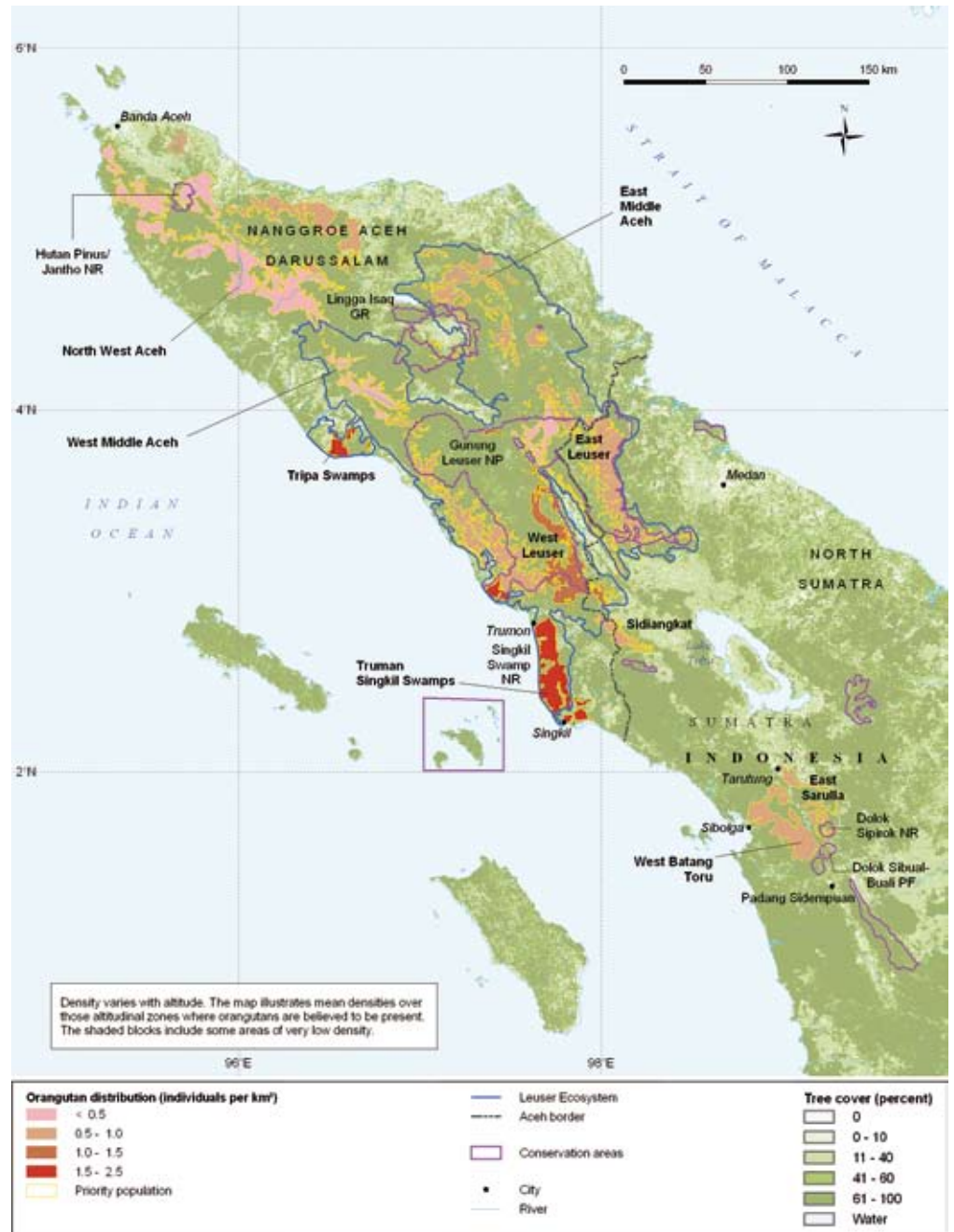
Figure 2: Sumatran orangutan distribution, with priority populations highlighted. Reproduced from Caldecott & Miles (2005); updated with GRASP priority populations. Sources: Dadi & Riswan (2004); Singleton et al. (2004).